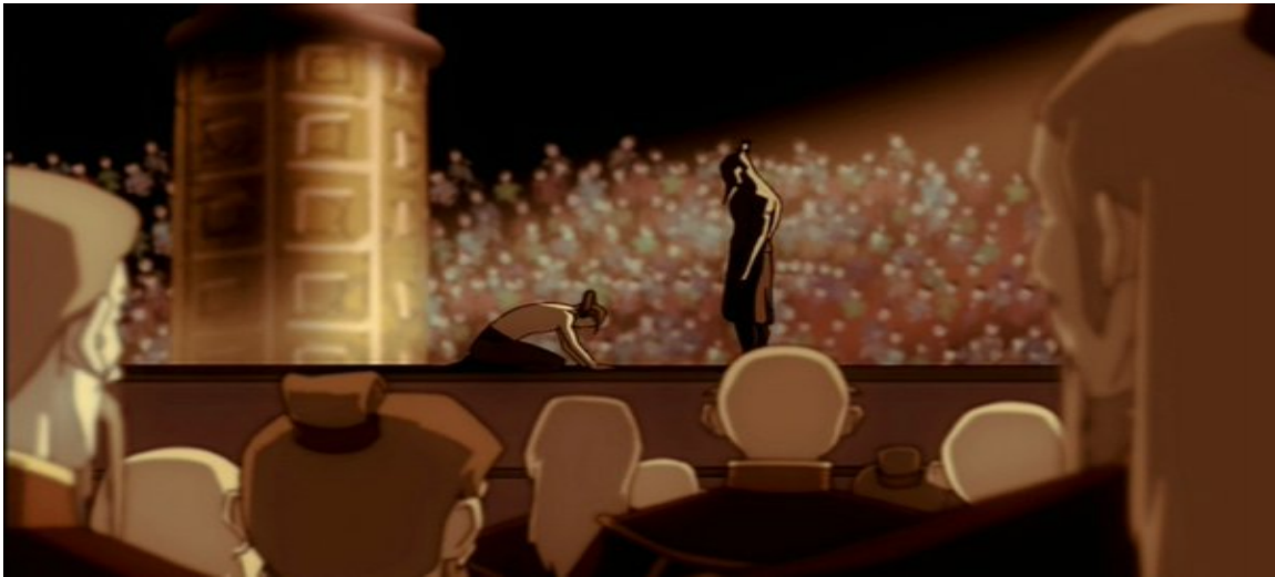
Fig. 1. Zuko begging for his father, the Fire Lords', forgiveness in S1:E12 "The Storm"

The Fire Lord asks Zuko to rise and fight, declaring that "[He] will learn respect and suffering will be [his] teacher." Uncle Iroh goes on to explain that by choosing not to fight, Zuko had shown "shameful weakness" and as a result was banished from the Fire Nation. Zuko's loss from the duel leaves him with a large scar that covers about half his face (which I'll return to in a moment.) Now, connecting what we know about the quilting point, it is understood that through Zuko's outspokenness, he had differentiated himself from his father, and by extension, the Fire Nation's ideology. This moment becomes the stitch for Zuko that solidifies his position against the Fire Nation, branded, figuratively and physically, as "dishonored." Prior to the Agni Kai with his father, it might be understood that Zuko's trajectory to the Fire Nation throne might have been straight forward as the heir, but since he had spoken out against his father, his actions quilted him to a future of reclaiming that which was lost. The connection here is for those that have experienced the loss of a future, that is, the viewers who might be able to identify the process of loss through their inherent immigrant experience. The difference for viewers is that their immigrant experiences may not have resulted in physical abuse from their family members.