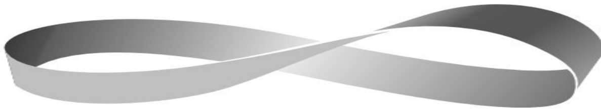
Fig. 2. Image of the Möbius Strip.